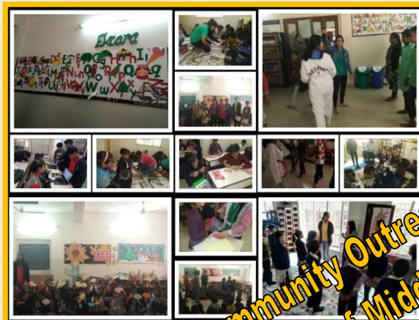
Community Outreach Programme of Middle School